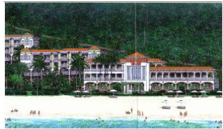
Centara Grand Phuket Beach Resort 2010