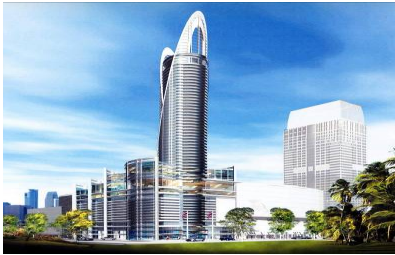
Centara Grand at World Hotel & Bangkok Convention Centre 2008

“The Only and most extensive fully-integrated Hotel, Convention Facility, Retail and Leisure complex in the Bangkok’s CBD”