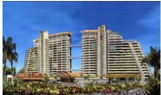
Centara Grand Mirage Beach Resort Pattaya 2009