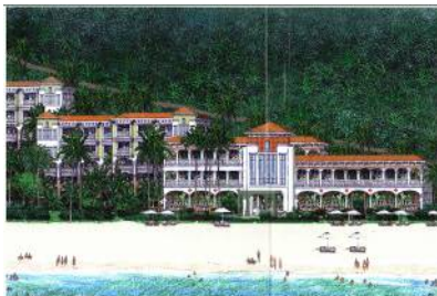
Centara Grand Phuket Beach Resort 2010

“The only 5-star beachfront Resort Hotel in Karon”