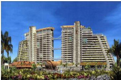
Centara Grand Mirage Beach Resort Pattaya 2009

Note: * Cost of leasehold right excluded