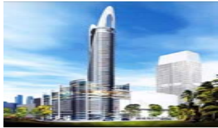
Centara Grand at Central World & Bangkok Convention Centre 2008